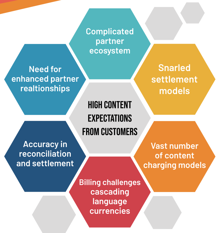
Key challenges for service providers in maintaining 5G content ecosystem

Easy and seamless adoption of 5G poses some unique challenges for communication service providers in any market. Apart from the network level challenges, service providers need to maintain stable relationships with a large content ecosystem, which includes various types of content owners and aggregators. Honouring various contract level parameters and settling all relationships in time are key for the success of any service provider in today's market.